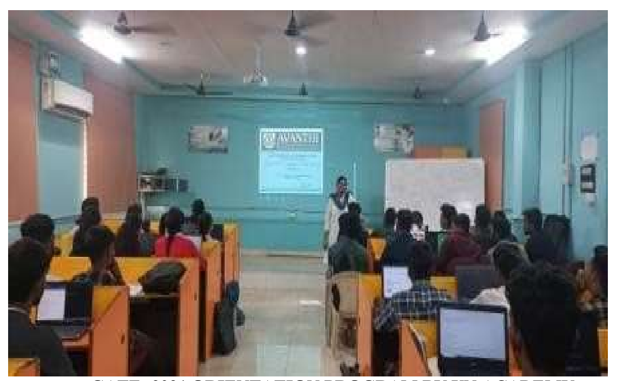
GATE -2021 ORIENTATION PROGRAM BY UN ACADEMY

Outcome: A Resource person from UN academy has started the gate awareness session in lively manner by asking questions on gate program and continued answering in such a way creating awareness of gate exam. The entire session held as a fruitful outcome and participated students feltvery happy with this program. In this program all final year students participated.